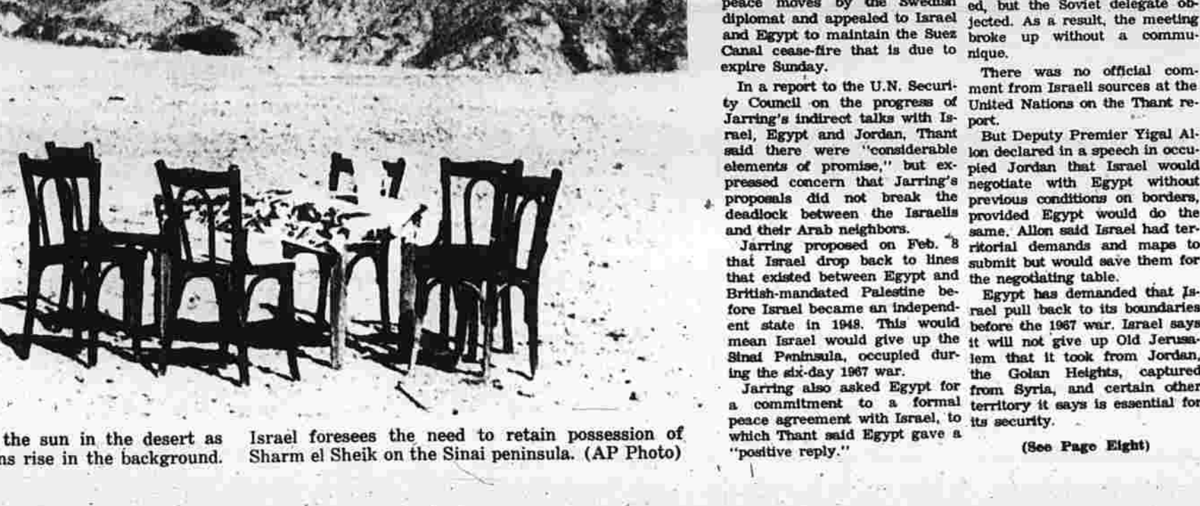
Table and chairs sit in the sun in the desert as Israel foresees the need to retain possession of Sharm el Sheikh on the Sinai peninsula.

State Department Official Urges Better Relations with Red China By SPENCER DAVIS Associated Press Writer WASHINGTON (AP) - The United States observes a total embargo on trade with China.