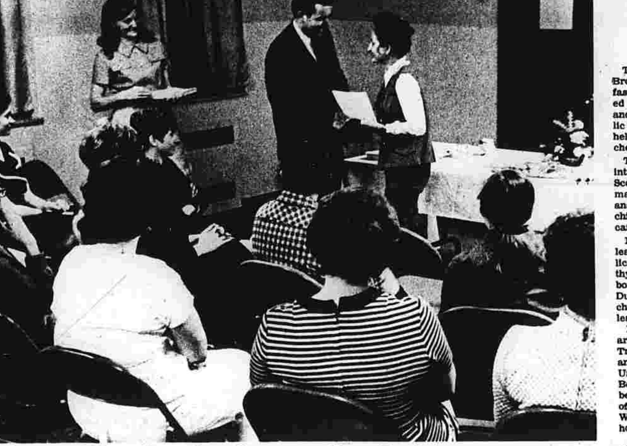
They Complete Coronary Care Training

WASHINGTON—Enrollment in government manpower work and training programs last June totaled 462,976, almost 8 percent more than the 423,208 enrolled a year earlier.