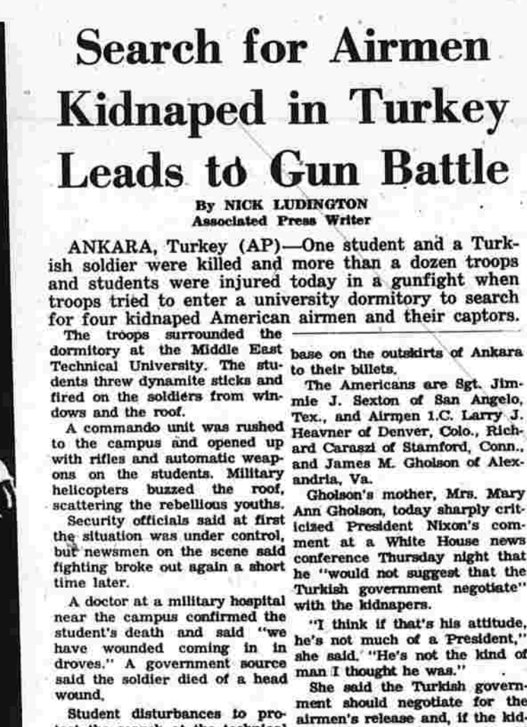
Airmen kidnaped in Turkey.

CL&P spokesman in Northampton said there was no sign of power being restored during the night.