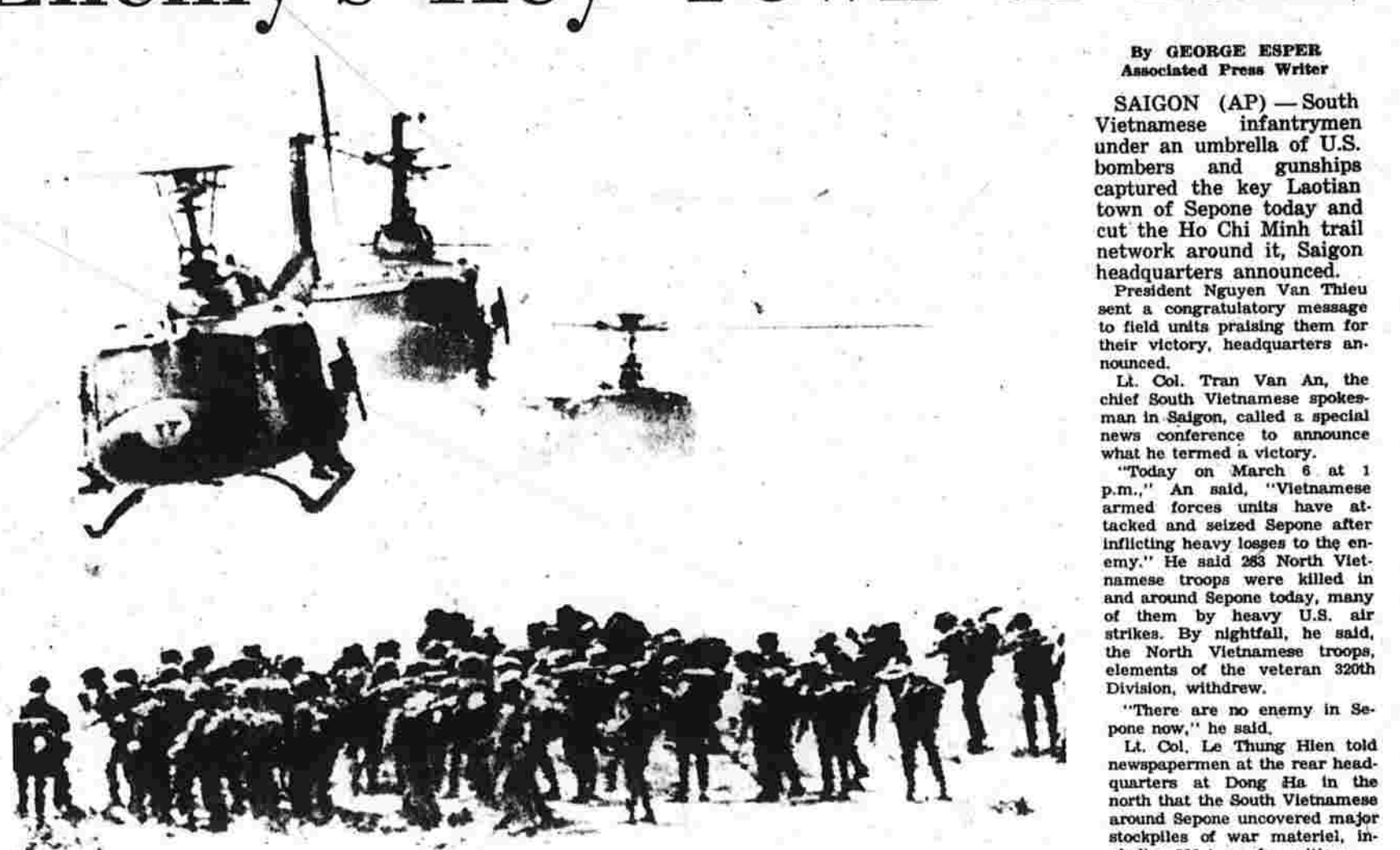
American helicopters stir up dust at Nguyen Hue base in South Vietnam as they land to pick up South Vietnamese being airlifted into Laos.

SAIGON (AP) - South Vietnamese infantrymen under an umbrella of U.S. bombers and gunships captured the key Laotian town of Sepone today and cut the Ho Chi Minh trail network around it. Saigon headquarters announced.