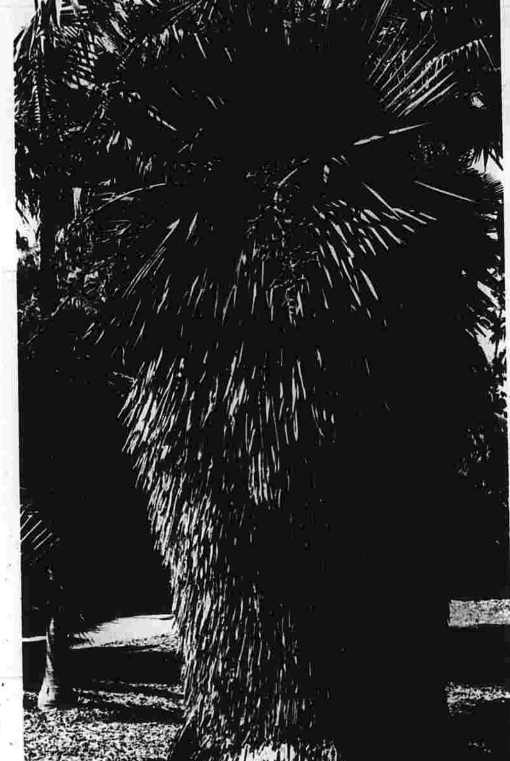
It is called a pettiocot palm and the name fits quite nicely. This one grows in a tropical garden in South Miami, Fla., where your garden editor had the good fortune to visit this week. The sun shown and the temperature was 80 degrees. They said there are about 500 kinds of palm trees in the Fairchild Tropical Garden and, if you are interested 5,000 species of palms in the world.

Hardly anybody sows lawn experiment station is with an acreage weed, the meter by cent that chokes canals and lakes if allowed to grow unchecked. It is a beautiful plant with fleshy green leaves and purple lavender blossoms, which grows in the cracks of sidewalks and other places where it does not need to be mowed along the highways or big square stacks of turf wherever "instant lawn" is to be developed. Growers of turf have a thriving business in Florida and they are about the only ones to mow for lawn grass seed. The weeds fill up their irrigation ditches or clog their pumps, lawns and gardens on contract. If you live in Florida in the winter and come back north for the summer you hire one of these companies to take care of the place while you are away. Visiting in Fort Lauderdale this week, I was shown around a University of Florida experiment station where some of Florida's fast land weeds are being managed under test conditions. One large plot, marked off in small squares, was being tested for "minimum maintenance." The kind of lawn that many people want is one that doesn't need to be watered, fertilized or mowed very often.